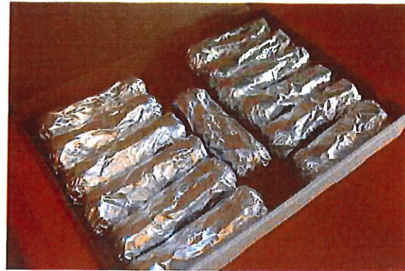
PEPPERONI ROLLS ARE EACH INDIVIDUALLY WRAPPED IN FOIL AND PACKED 13 ROLLS PER BOX